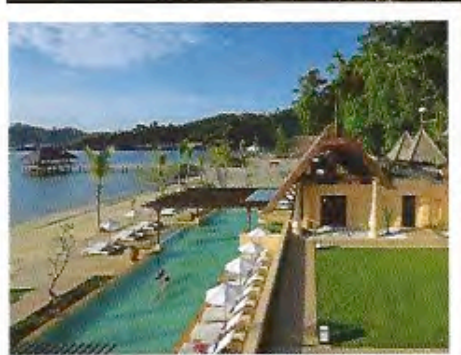
Above: picturesque views from selected villas at Gaya Island Resort. Left: the pool at Gaya Island Resort. Below: relax on Tanjong Jara Resort's golden beach. Below right: a room at Tanjong Jara Resort