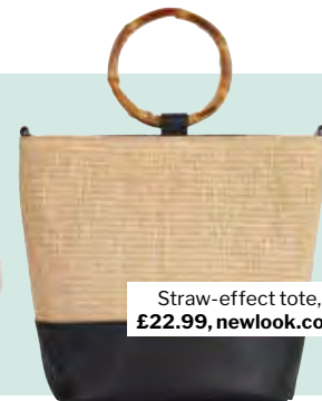
Straw-effect tote, £22.99, newlook.com

Arriving on a picturesque Mykonos cliffside this spring, The Wild Hotel is an elegant retreat with a traditional Grecian look and up to 40 suites and villas. Overlooking Kalafati Beach , it also boasts an infinity pool with Aegean Sea views and a private beach. thewildhotel.com