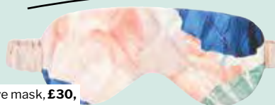
Silk eye mask, £30, nuiami.com