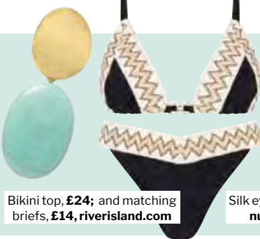
Bikini top, £24 ; and matching briefs, £14, riverisland.com