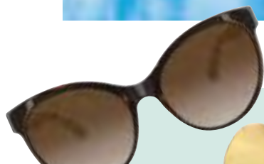
Tortoiseshell sunglasses, £165, aspinaloffondon.com

Tempted to parasail or jet ski in your gown? Kandima Maldives is now challenging fearless brides with its Let's Go Crazy and Trash That Dress package, available to couples who wed there. Extras include a couple's massage, bottle of champagne and cocktail session. From £1,148 per couple; kandima.com